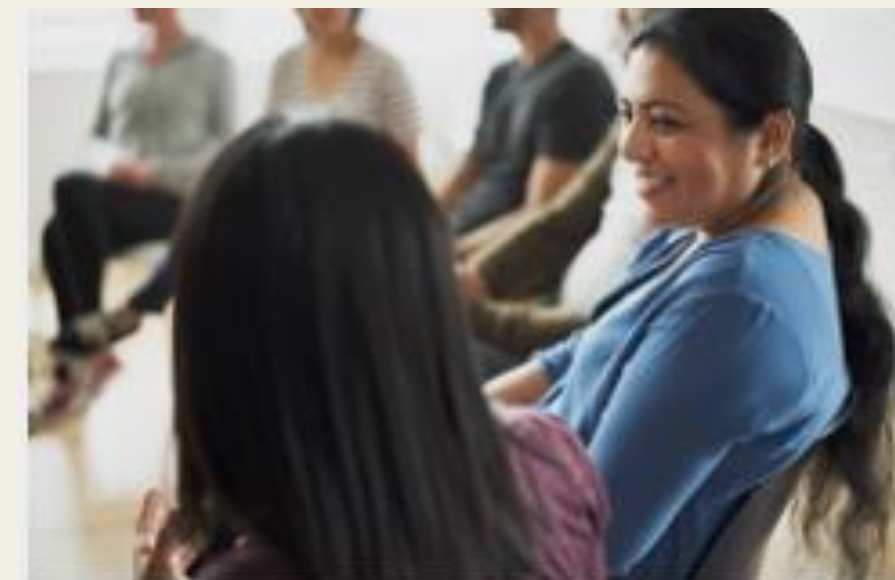
JOIN A CAREGIVER SUPPORT GROUP