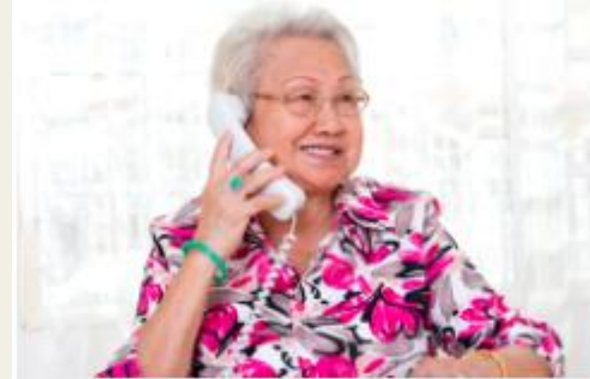
ONE-ON-ONE CAREGIVER COACHING