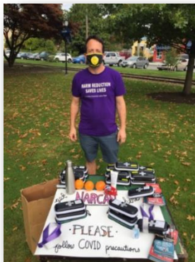
(Pictured above on previous page: Cowichan CAT members from Cowichan Tribes reaching out to the public to talk about harm reduction. Pictured above right: A Cowichan CAT Peer in a local park for pop up Naloxone Training. Pictured above: Tzinquaw Dancers Open Overdose Awareness Day in Downtown Duncan.

governments, community agencies, individuals with lived experience and Island Health are instrumental in improving health outcomes for this very vulnerable population and to mitigate the impact on community.