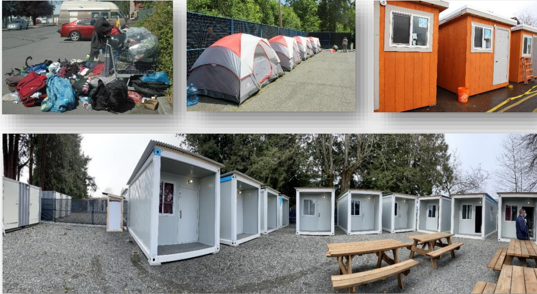
Photo above: Many unhoused people in Cowichan have gone from the streets to protected tents to wooden sleeping huts. Residents of sites at Cowichan Tribes and Saint Julien Street have now transitioned into larger, healthier sleeping cabins and have access to food, outreach, MHSU supports, primary care, washrooms, showers and running water.

The Cowichan Region was more prepared for the COVID Pandemic than we could have been imagined. Established relationships and the work completed in 2019 to create the “Vision for Community Wellness,” was the foundational plan for the response for the under housed and underserved community when the Pandemic struck. After almost two years of shelter residents have shifted from surviving to thriving. Oversight, food, outreach services, safe supply for those who wanted it, primary care and security were provided. Immediately the effects of the housing first approach began to have an impact as individuals stabilized. Residents are healthier, happier, use less substances are flourishing. The shelter project has been successful in mitigating the impact of COVID as the Cowichan Region through this project reported some of the lowest numbers of COVID in the underhoused populations on Vancouver Island. In addition to temporary shelter 52 people have moved into permanent supported housing with more to come in 2023. Their impact statements from the initial housing are here: