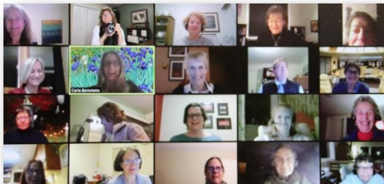
(Pictured left: Our Cowichan Regional virtual gatherings continue in 2021. Above; OCCHN Completes the revision to the Cowichan Communities Health Profile which can be found at www.ourcchn.ca )

Cowichan Community Action Team (CAT)The opioid crisis has paralleled the pandemic in our region. The efforts of the CAT highlight the ongoing crisis which has enabled $66,980.00 in funding from the Overdose Emergency Response Centre to come to our community for 2021. We were able to pilot a very successful peer lead Street Smart Outreach Team that in addition to reaching out to individuals on the street provided lifesaving Naloxone and revived 6 overdoses. Our CAT has grown to over 180 members who work diligently to address substance use in our region. With that said, the poisoned drug supply is relentless and lives continue to be lost as the Cowichan Region grieved with the deaths of 31 individuals in 2021 due to suspected drug poisonings (an increase of 3 over 2020), and reported 384 ambulance attended overdoses (an increase of 42).