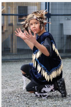
Pictured above: a young Tzinquaw Dancer opens the Village with a traditional cultural welcome. Pictured above right: Thousands march in support of Truth and Reconciliation Day

discovery of unmarked graves. We celebrated with them on Truth and Reconciliation Day and continue to strive to educate ourselves and our Health Network to do all we can to improve cultural knowledge and relationships within the Cowichan Region. We continue to better address systemic racism by providing space for conversation, to learn, to identify where racism exists, and to act to change our ways.